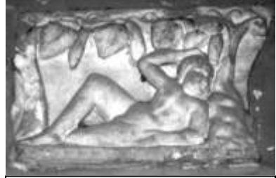
Jonah relaxing under the vine was a secret symbol of Paradise and the Tree of Life at a time when Christianity was persecuted by the Roman government.

From a Jewish point of view, this makes perfect sense. Gan Eden , the Hebrew name of the Garden of Eden, is also the Jewish name for paradise, the place to which the souls of the righteous go after death. 85 Our English word “paradise,” in fact, comes from the old Greek translation of the word “garden” in the “Garden of Eden.” 86 In Greek, the “Garden of Eden” is the “Paradise of Eden.” The message of Revelation is that the Garden of Eden—paradise ( Gan Eden , the new Jerusalem)—will descend from heaven and will be our eternal dwelling in the new earth (Rev. 21:2,10). 87 As it says in Rev. 2:7: “To the one conquering, I will grant him to eat from the tree of life, which is in the paradise [the garden] of God.”